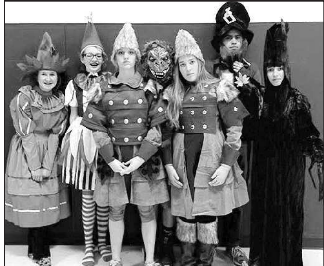
Cast members of the Heppner High School production of The Wizard of Oz.

The Heppner High School drama department will present "The Wizard of Oz" this Friday, April 24, and Monday, April 27. Both performances are at 7 p.m. in the HHS cafetorium. Admission is $5.