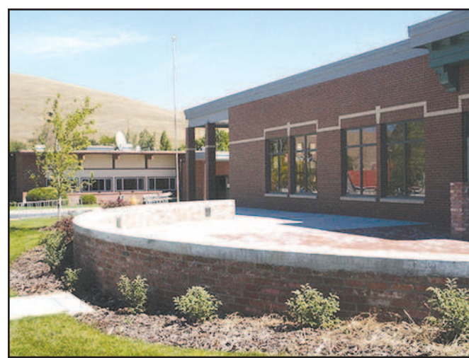
Heppner Elementary underwent a "lock-out" Monday morning due to a police incident in the school's back parking lot.

According to information released by the school, an incident in which police officers were involved occurred in the HES back parking lot. The Morrow County Sheriff's Office requested that Heppner