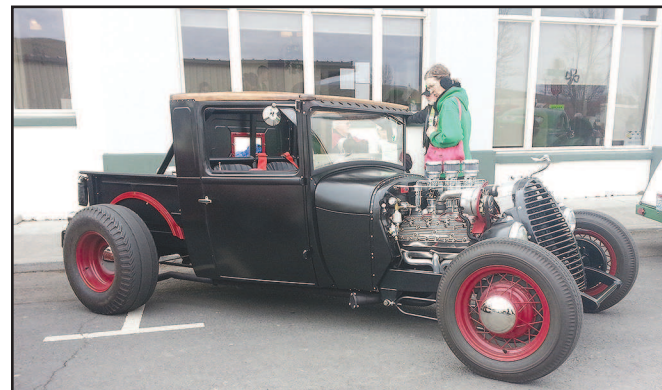
The annual Cruz-In, set this year for March 14, shows off classic cars ranging from vehicles like this oldie-but-goodie to modern street rods.

On March 14, the 14 th annual St. Paddy's Cruz-In will be held during the 33 rd annual St. Patrick's Celebration in Heppner.