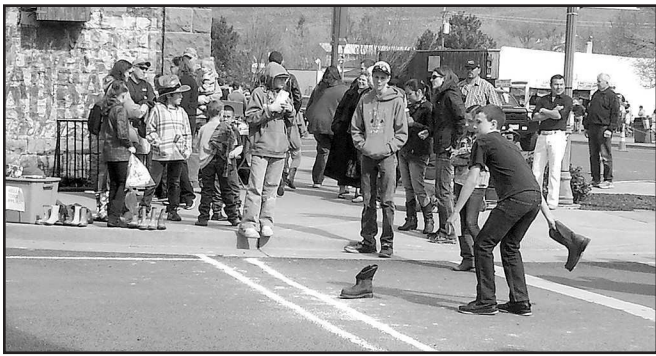
A teen winds up for the toss during the 2014 Welly Toss.

—Continued from PAGE ONE will work with schedules. Team registration forms are available at the Heppner Chamber of Commerce Office. They are due to the chamber office by Thursday, March 12, or teams can bring forms with them and turn them in at the registration desk.