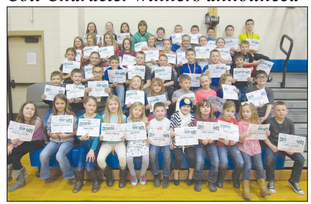
HES recently announced the Colt Character winners for November and December (see names below).

Heppner Elementary School has announced Colt Character winners for November and December. The character trait was Managing Yourself, which included time, energy, thoughts and feelings. Next month You Want to be Treated; it includes empathy, respect, kindness and cooperation.