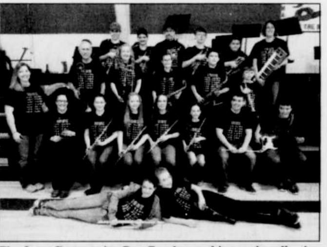
The Ione Community Pep Band was this year's collective grand marshal for Ione's Red, White and Blues Fourth of July parade.