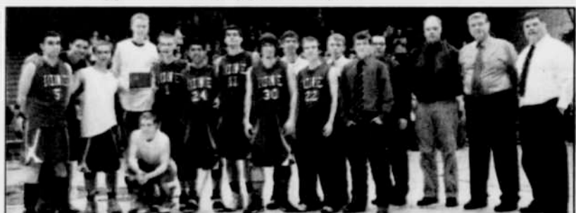
The Ione Cardinals took second place in the Big Sky district tournament, earning them a slot in the first round playoffs in the 1A state championship tournament.