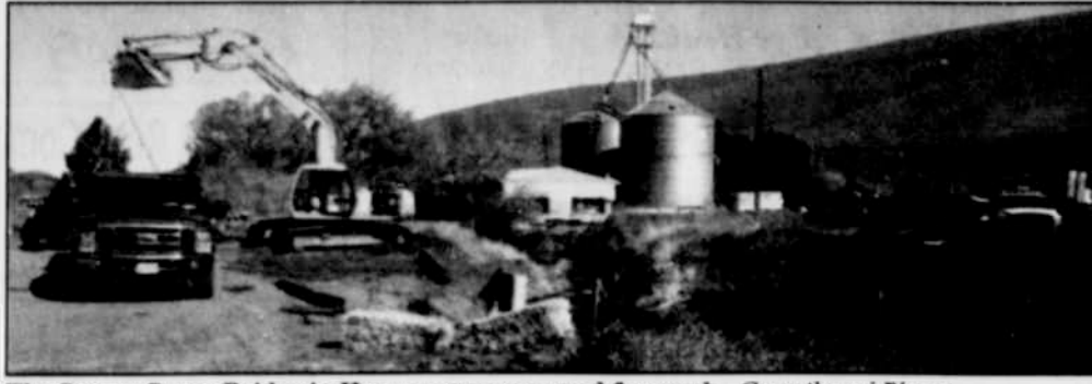
The Sperry Street Bridge in Heppner was removed for good.