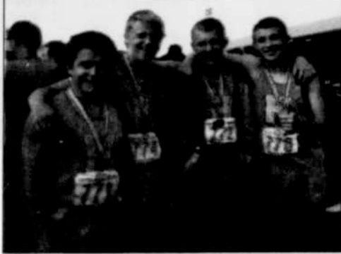
Heppner boys 4x100 relay team placed seventh in finals at the OSAA 2A State Championships with a time of 47.41a.