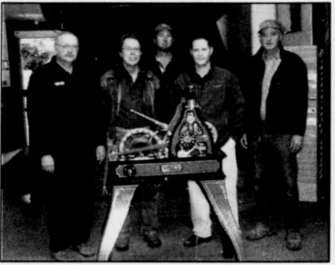
The Morrow County courthouse clockworks returned from prison to their home in the courthouse.