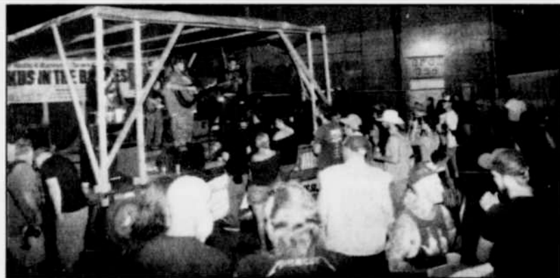
Locals and visitors alike gathered for the first Ruckus in the Boonies music festival in Heppner.