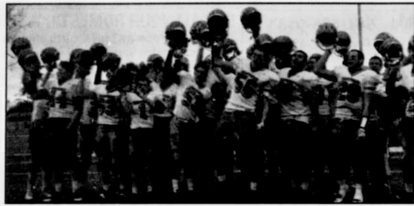
The Mustangs were defeated but not down after a cold and snowy 2A state championship game.