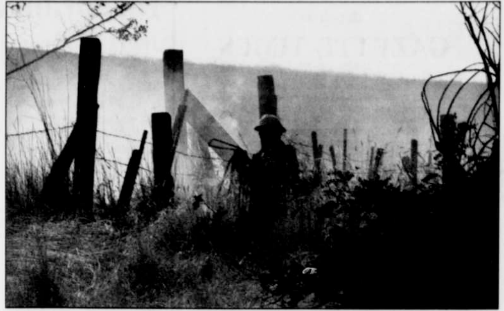
The fire that infringed on Heppner city limits and burned nearly 1,000 acres of grass was one of the local highlights of 2014. Find more memories on PAGE EIGHT

VOL. 133 NO. 52 8 Pages Wednesday, December 31, 2014 Morrow County, Heppner, Oregon