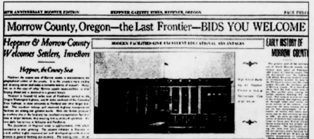
Heppner Gazette-Times. (Heppner, Ore.) 1925-current, February 09, 1928, 45 th Anniversary Booster Edition, Image 35.