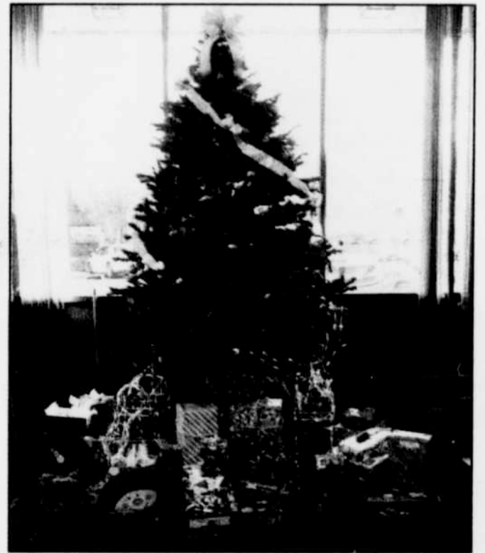
In the spirit of the season, Bank of Eastern Oregon employees volunteered to bring joy to three families for Christmas. Employees drew a mitten tagged with gender, age and size from a giving tree and got the job done.