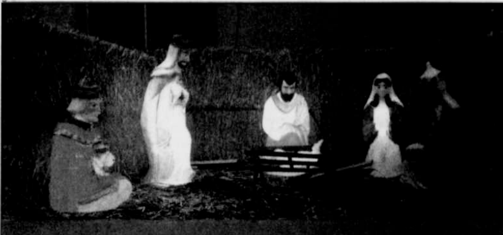
This nativity scene, or creche, in front of the Christian Life Center glows in the twilight as it celebrates the "Reason for the Season." For more Christmas inspiration from area churches, see PAGE SIX; Christmas greetings from local businesses are found on pages FOUR and FIVE.