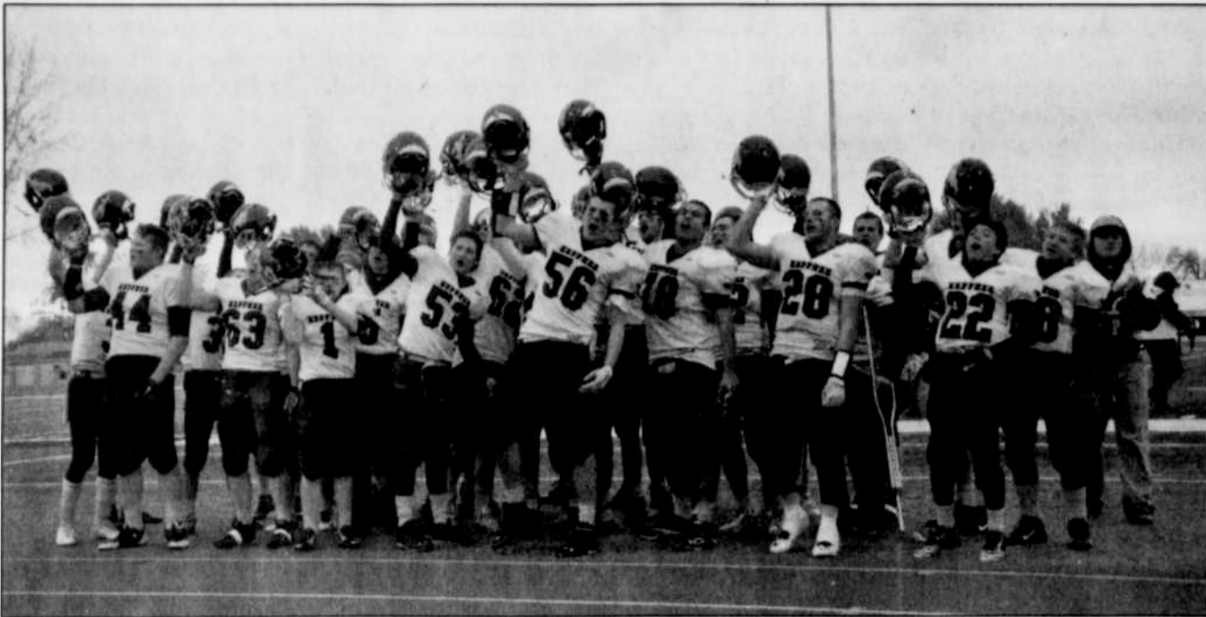
The Mustangs entered a cold and snowy 2A state championship game several players short and with others injured. Despite the odds, the 'Stangs never gave up, even when faced with a 49-0 defeat at the hands of the Burns Highlanders.

The Heppner High School Mustang football team finished a magical season as the second place team in the state. The Mustangs lost in the OSAA State Championship game to the Burns Highlanders by a score of 49-0.