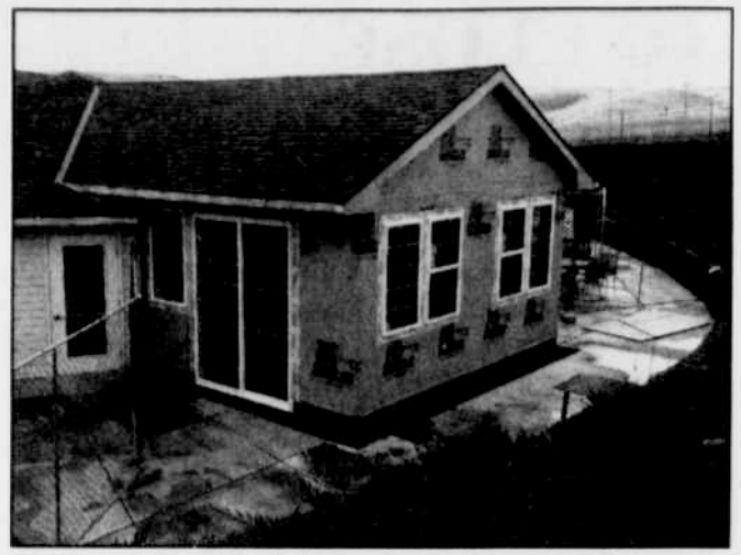
Residents and staff at Willow Creek Terrace hope the completion of this new addition will give them something to be thankful for this Thanksgiving.

The opinion on "Boston Creme Pie Day" (27 th ) was almost unanimously positive, as was the opinion of the Walt Disney movie industry that came into theaters on Oct. 27 in 1954. Residents also had opinions about some of the Disney movies, including