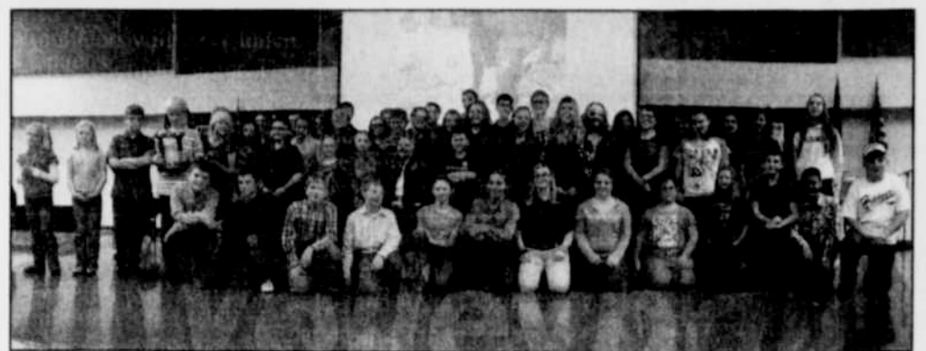
Morrow County 4-H members recognized during the 2013 4-H Achievement Night.

Memberships pins are given to Cloverbuds and