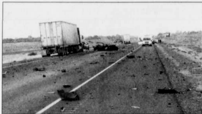
The collision that made scrap metal of this 2012 Ford Mustang also claimed the life of 80-year-old Melvin Mitchell of Richland, WA.

Oregon State Police (OSP) is continuing the investigation into Monday morning's multi-vehicle collision on the westbound lanes of I-84 near Boardman that resulted in the death of an 80-year old male from Richland, WA.