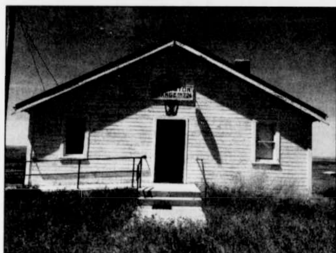
Lexington Grange #726 has been reinstated and restored, and its members are full of plans for the future.

Morrow County School District has reported that its students outperformed comparison school districts data on five of six outcome performance measures as it relates to what students are achieving in high school. MCSO has eight schools within the district. Half of the schools within the district yielded strong performances based on the new state school-rating criteria,