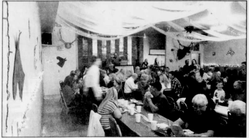
A large group of Heppner Booster Club supporters enjoys the annual steak feed at the Elks in Heppner last Saturday. The dinner was followed by a live and silent auction, as well as raffle and penny board events, to raise money for local school programs.