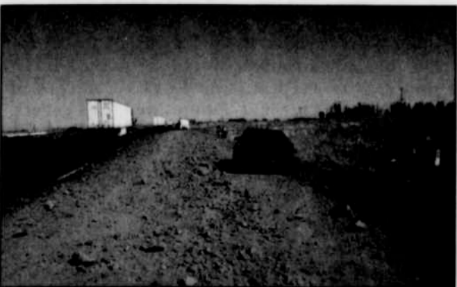
Oregon Dept. of Transportation (ODOT) had its work cut out clearing rocks from I-84 when a truck pulling a belly dump trailer loaded with large rocks spilled its load onto the east-bound lanes near Boardman last Friday afternoon. ODOT and Oregon State Police responded to the scene. Only one vehicle was reported damaged.

ALL NEWS AND ADVERTISEMENT DEADLINE: MONDAYS AT 5:00 P.M.