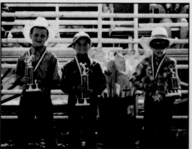
Six and seven year olds