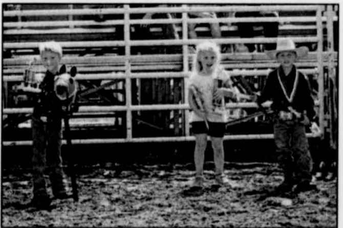
Four and five year old