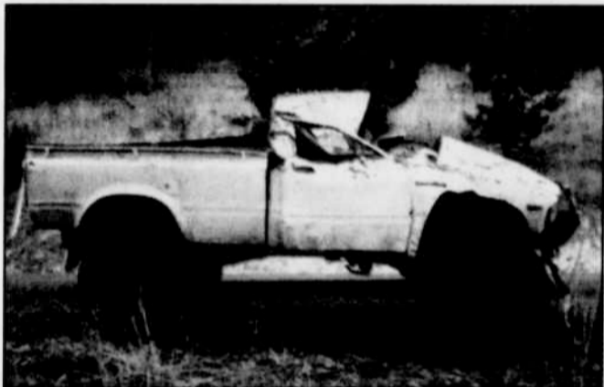
Car totaled in rollover

"We are praying for the best, but medical expenses are already piling