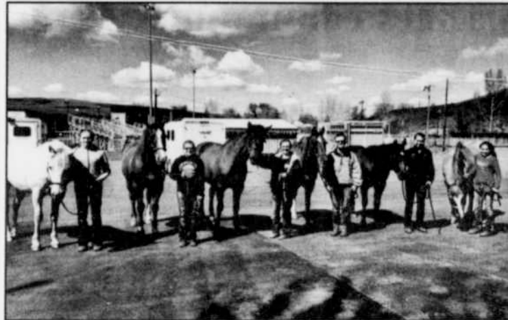
Horse show participants

450 Tatone Street, Boardman - Open Mon. 7:30 am- 7 pm, Tues.-Fri. 7:30 am - 5 pm