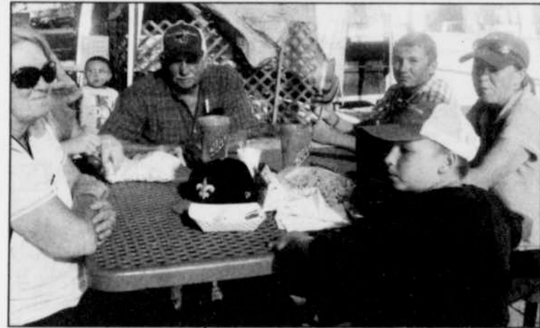
Fairgoers enjoy a meal at the picnic pavilion