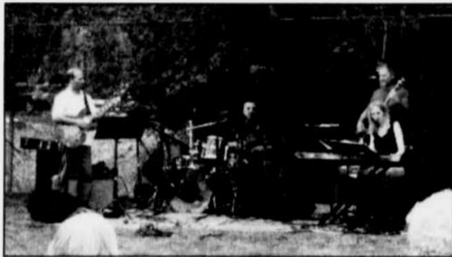
Envoy performed at Heppner's Music in the Park on July 27. The Lower Field below the grade school turned out to be the perfect venue for locals to spend a midsummer evening with talented musicians.