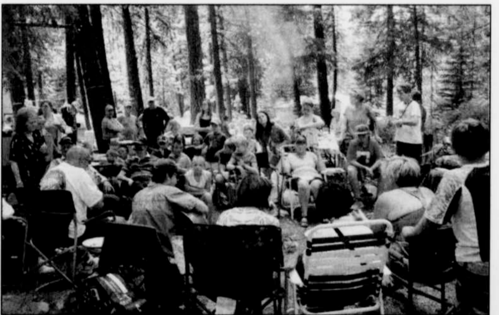
It's difficult to fit 104 people around a campfire, but the Steagall family tried at its recent reunion at Bull Prairie.

One hundred and four people attended the Steagall family reunion at Bull Prairie July 9-13, 2014, spending time biking, swimming, paddle-boating and canoeing, as well as swapping stories around the campfire...and, of course, eating.