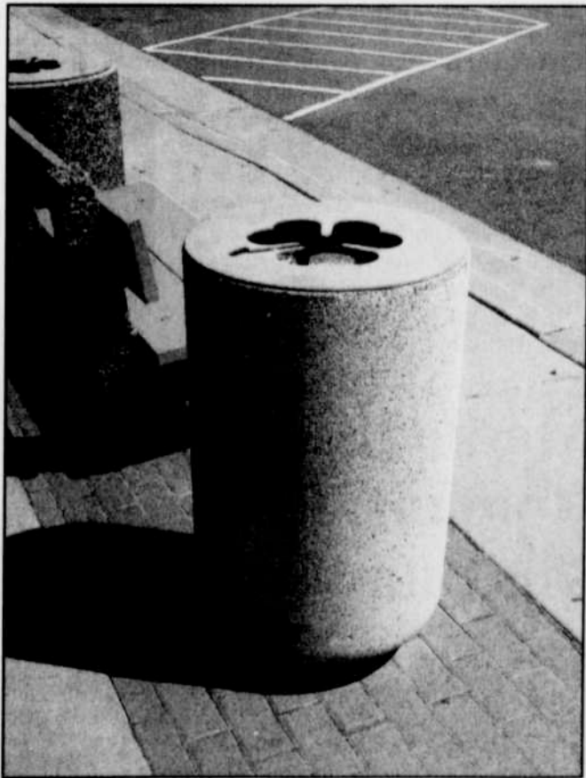
Ash trays like this one on Main Street may not be needed anymore if Heppner passes an ordinance to ban smoking on sidewalks.

Would outlaw smoking in parks and on sidewalks