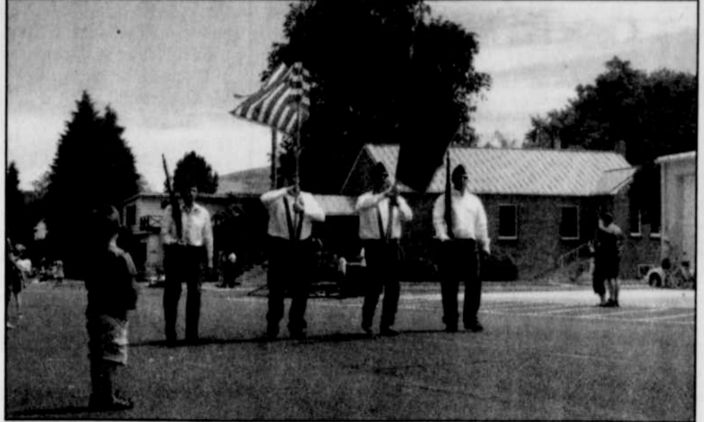
A young spectator stands in awe as the lone American Legion color guard leads the way during the Red, White and Blues parade last Friday in Ione. -See more photos PAGE FIVE