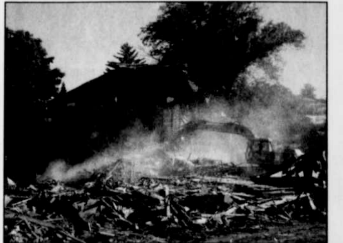
A backhoe works to deconstruct the third and final house that will be cleared to make way for the construction of a new county building next to the courthouse in Heppner.