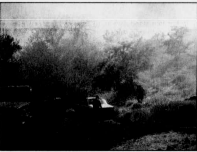
A haze of smoke blinded and made breathing difficult as volunteer firefighters from around the county worked to quench the flames around Heppner.