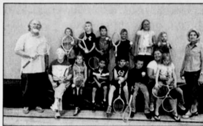
Students in the Summer Enrichment Program at Heppner Elementary were surprised with tennis rackets and a quick lesson at the end of their classes.

The class's tennis coach said she was pleased to see