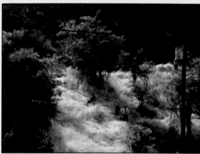
Townpeople help create a line of defense against the fire west of the Heppner housing line beyond Gale Street.

Estimates on the number of acres consumed vary, but Rhea said he