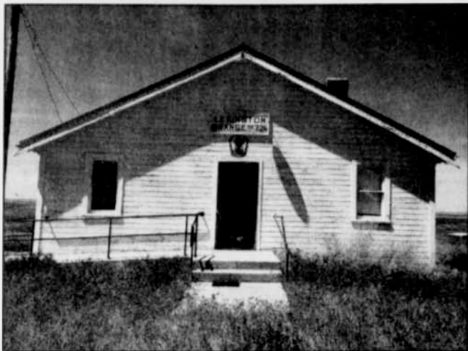
The Lexington Grange hall will be cleaned up this week in preparation for reinstatement.

Those who remember the Lexington Grange may be happy to hear work is being done to reinstate it into active use.