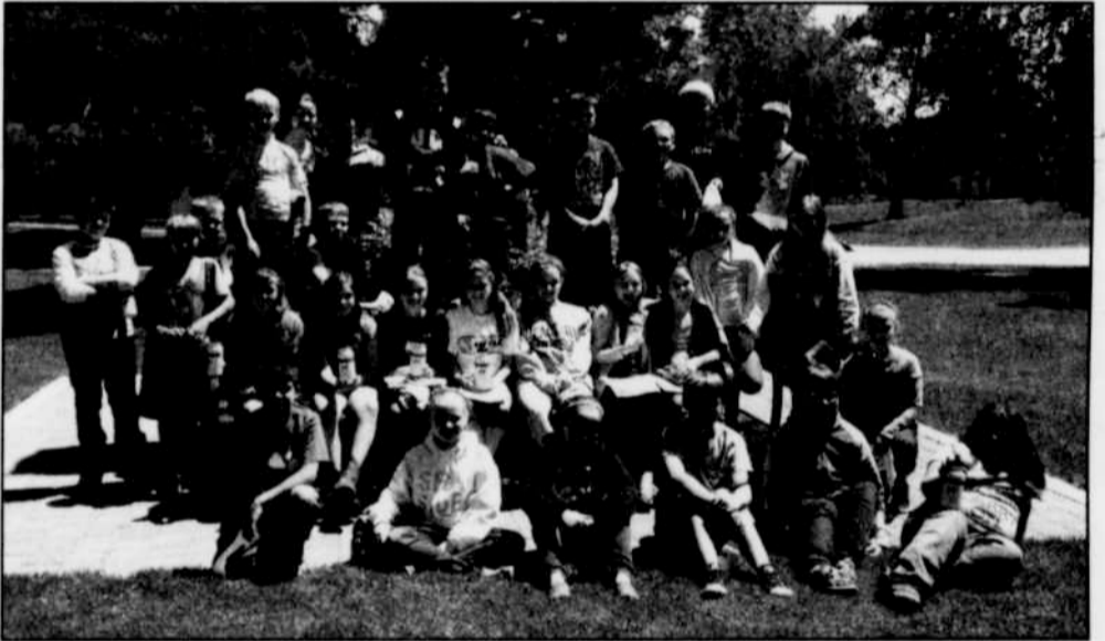
On May 29, the Heppner Elementary fifth-grade class was invited to spend the day on the Eastern Oregon University campus. This experience was part of the Eastern Promise class that these students have been taking during this school year. The fifth-graders were given a tour of the facilities and treated to lunch.