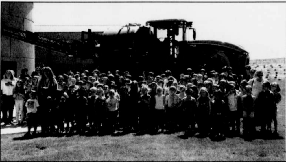
The Heppner Elementary Accelerated Reading (AR) students traveled to the SAGE Center in Boardman for their annual AR field trip; 137 students from HES were eligible, having passed all four of their AR goals during the school year. Students enjoyed a tour of the center, which included learning about all the products our county produces and a simulated hot air balloon ride over Morrow County.