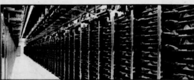
Data centers like this one are popping up throughout Eastern Oregon and changing the face of jobs in the region.

By Andrea Di Salvo The job landscape in Morrow County has long been nearly as predictable as the land itself. It's a landscape grounded in agricultural, built through timber and then expanded into the food processing plants along the Columbia River. As the county enters the 21 st century with the rest of the world, though, that landscape is changing. Now, some seeking employment in Morrow County may swap out their tractors or potato chips to work on another kind of farm. New, high-tech server farms, or data centers, are popping up throughout Eastern Oregon, attracted to the state by tax breaks, relatively cheap power and a mild climate that helps keep their computers cool. Buildings like the new Vadata, Inc. structure at the Port of Morrow house some of the web's most advanced technologies, and they're hiring for jobs to match. Take, for instance, some of Vadata's current postings on internet job sites... cabling infrastructure engineer, senior manager of data center operations, data center technician, and lead cabling support technician. If the name Vadata doesn't sound familiar, you might be more familiar with its parent company, the web mammoth Amazon.com. It's through server farms like those at the Port that the internet giant powers its international commerce