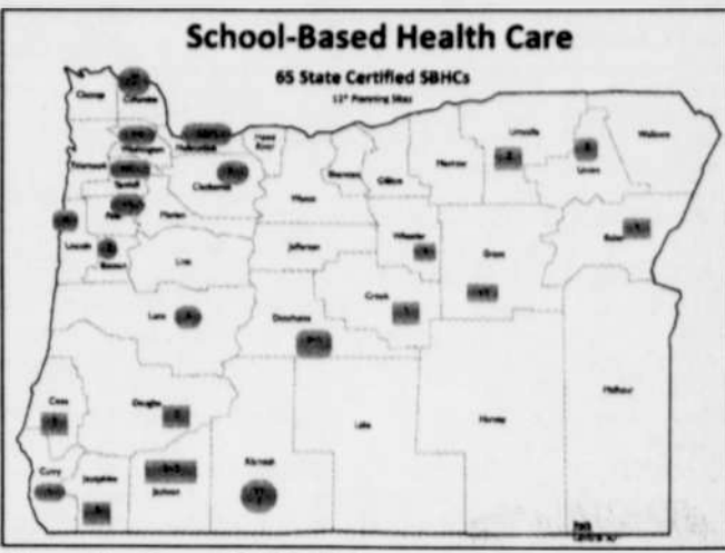
Currently, 65 certified SBHCs operate in 21 Oregon counties, with 12 sites currently in the planning and development phase.