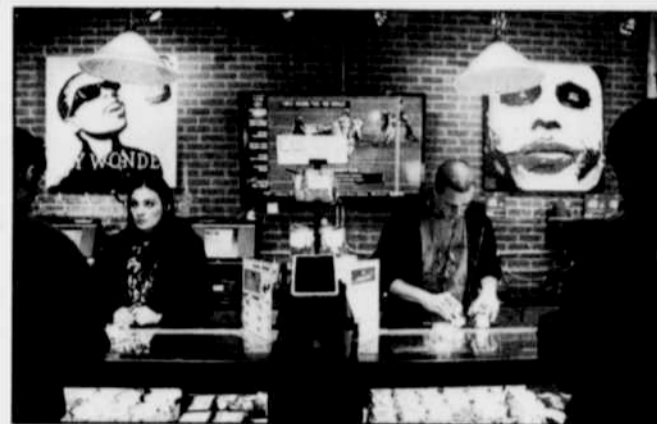
Morrow County will hold public hearings to discuss a moratorium banning medical marijuana facilities like this one, which are now legal in Oregon.

Medical marijuana facilities are legal in Oregon; however, a bill has been passed allowing counties and cities to place a ban on the facilities until May