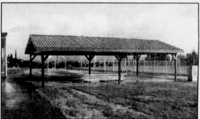
An example of the new 24 X 48-ft steel pavilion building planned near Boardman on the river.

and vital rural communities. Since the foundation stands for committed to community vitality, they have been bringing leadership training to groups of citizens in Morrow County for four years. Through the leadership development training, the ultimate goal is and has been to improve the quality of life for all the members of our rural communities. The people involved in the training choose a project and go on to work collaboratively to bring the project to completion."