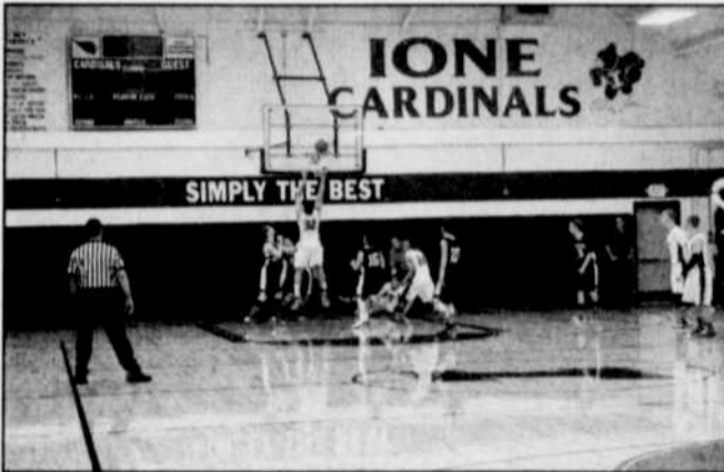
Ione's Tre Neal with a jumpshot in the first-round game against the Eagles.

Haguewood: 23 pts, 22 rbd Conboy: 10 pts, 15 rbd Neal: 13 pts, 10 rbd, 3 blocks Hughes: 15 pts Jobes: 7 pts Patton: 6 pts Juarez: 1 pts Scores by quarter: HIS: 24, 15, 20, 16: 75 SV: 11, 23, 11, 14: 59 Three-Pointers: 6 Free throws: 9-14