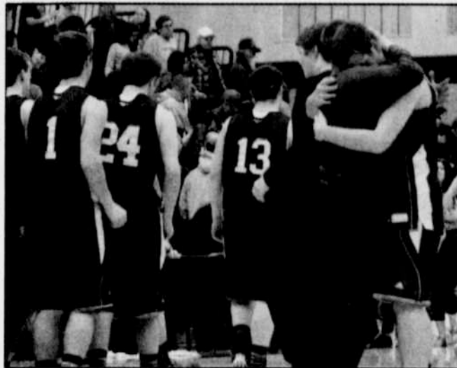
Mustang players leave the court in defeat after a hard-fought and emotional district game against the TigerScots.