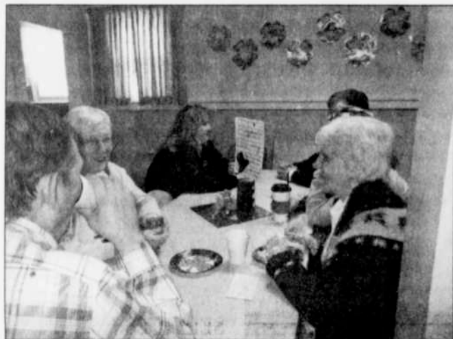
Locals catch up over coffee and snacks at the Heppner Methodist Church before the 2013 Remembrance Walk/5K Run last St. Pat's weekend.

"We want everything we raise to stay right here in the community," she says.