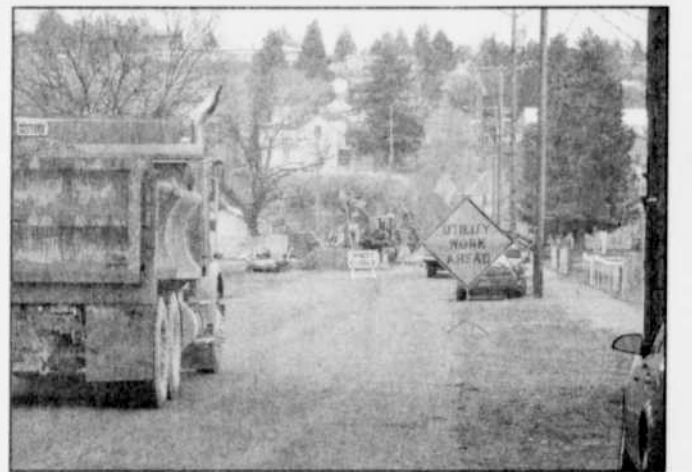
A portion of Chase St. will be closed for a couple of weeks for sewer repairs, the City of Heppner announced this week.

For additional information please call Heppner City Hall.