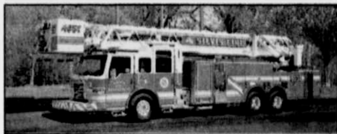
The Columbia River Enterprise Zone approved purchase of a truck similar to this one for the Boardman Rural Fire Department. The bigger, updated truck is needed to provide fire protection for the new industrial construction at the Port of Morrow.

In an effort to keep up with added fire protection demands brought on by the new construction at the Port of Morrow, the Columbia River Enterprise Zone approved purchase of a new 100-foot aerial fire truck for the Boardman Rural Fire District Monday. Fire Chief Marc Rogelstad brought specs and a financing plan for the new fire truck to the CREZ meeting, and said the truck