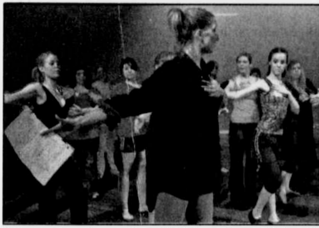
The choreographer works with Eastern Oregon University students in preparation for a previous year's musical. The musicals have become a tradition with EOU. This year's musical, the Then & Now Hit Shuffle, will be in Heppner Feb. 9.

The Eastern Oregon University Music Department and Chamber Choir are bringing their winter extravaganza of singing and dancing to Heppner on Sunday, Feb. 9, at 3 p.m. The performance will be held in the Heppner Elementary School gym.