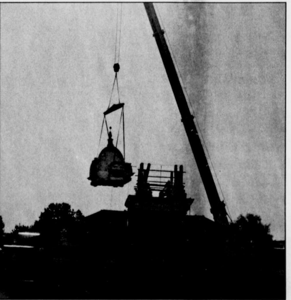
The clock tower on the Morrow County Courthouse was removed for renovation in July.