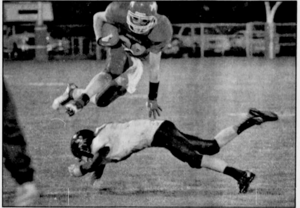
The Mustang football team leaped ahead in standings and was unstoppable until it was brought down by Regis in state semifinals.