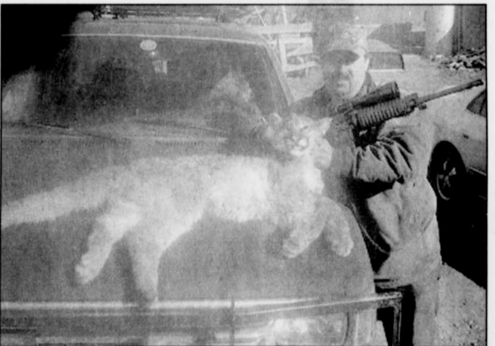
This cougar was shot near Heppner.