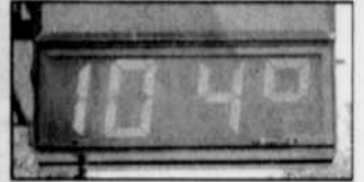
Temperatures put Morrow County through the ringer, with highs of more than 100 in July (above) and lows that plummeted to below zero in December (below).