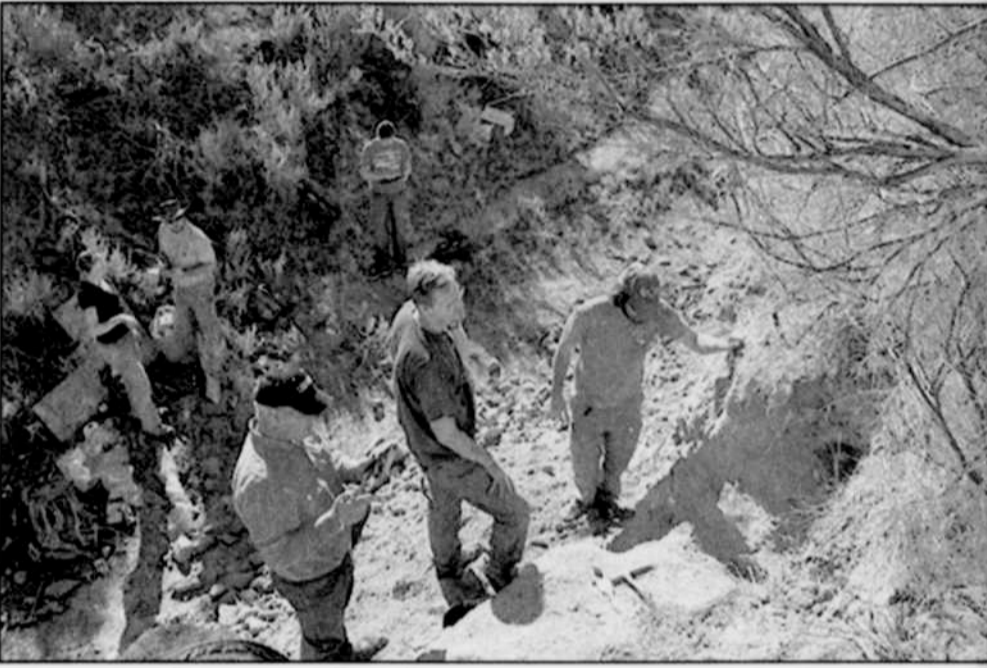
A mammoth tusk was excavated near Ione.