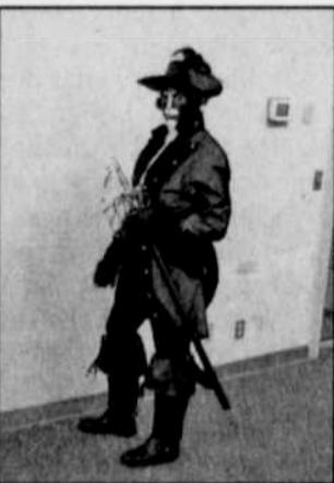
Puss in Boots paid a Halloween visit to Heppner.