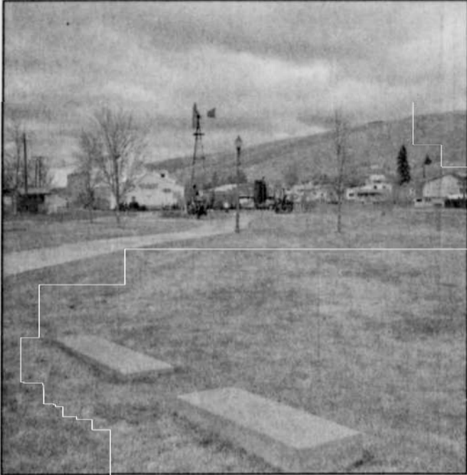
A debate over park statues sparked controversy.