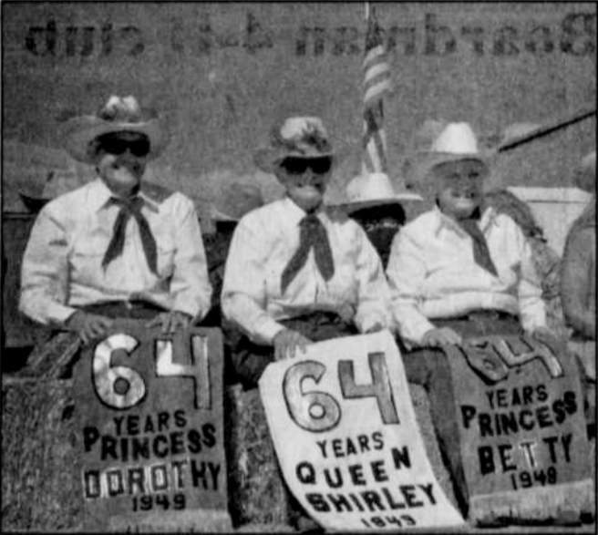
Morrow County celebrated its centennial fair, with a return of past fair and rodeo royalty.