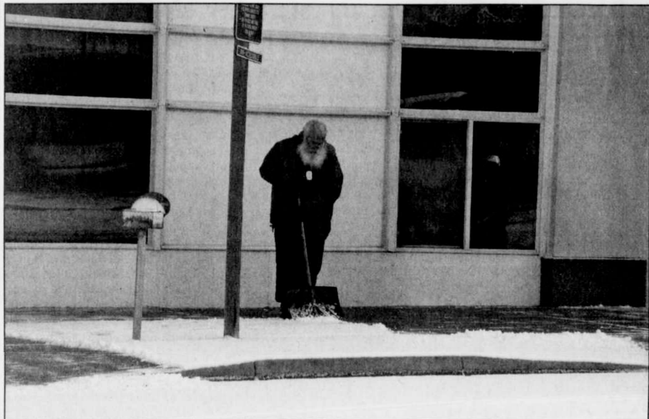
Snow added to the holiday atmosphere in South Morrow County this week, even bringing about a surprise visit from Santa, who donned his work clothes and stopped by to help with some winter chores in front of St. Patrick's Senior Center in Heppner Tuesday. The snow also brought some not-so-merry events, with more than one traffic accident on the slippery roads.