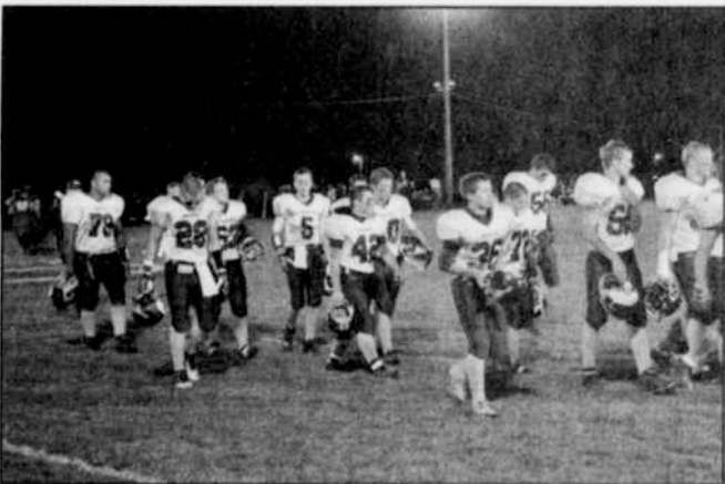
The Mustangs come in from the introduction of the teams at the beginning of the game against the TigerScots last Friday. Heppner took out the TigerScots on their home turf in a decisive 40-6 victory.

Reedsport is the number-three team from Special District 1; they finished the year with a record of 7-2 and were ranked 15th in the final OSAA rankings.