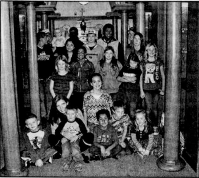
A group of catechism students from St. William's Catholic Church in Ione took a trip recently to view the largest rosary collection in the world.

The catechism students of St. William's Catholic Church of Ione spent their Sunday, Oct. 27, afternoon on a trip downriver to view the largest rosary collection in the world.