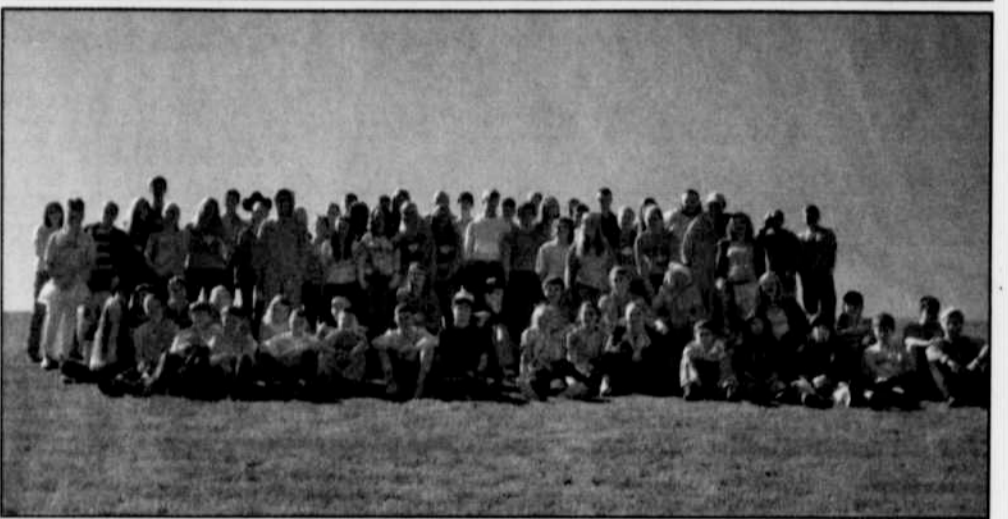
The Heppner High School Future Business Leaders of America (FBLA) once again supported breast cancer awareness during breast cancer awareness month in October. As part of that, the group asked the community to wear pink on Oct. 10 in support of the cause, and many in the local schools and businesses took them up on the challenge. Top: Heppner Elementary School students show the power of pink on the HES playground. Bottom: Students at HHS show their solidarity with the cause through an array of pink clothing and accessories.