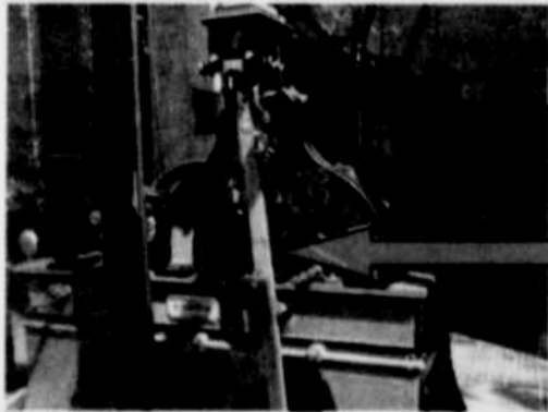
This shows the clock gears. These have 5 spokes and range from 4 inches in diameter to 8 inches in diameter. Missing several of these.