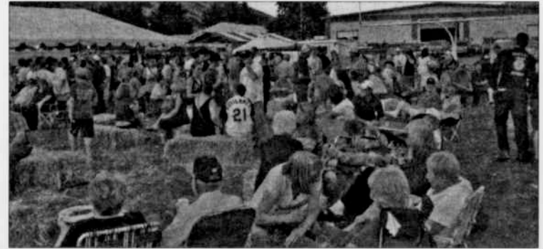
Murray's Beer & Wine Tasting

The Murray's Country Rose wine and micro-beer tasting has quickly become a much-anticipated fair-time highlight. The 17 th annual version of the event promises to be no different.