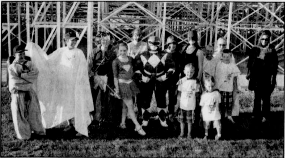
The Morrow County Relay for Life, though a poignant reminder of loved ones lost in the fight against cancer, also had fun activities, with themed laps and special events to brighten the long hours. Pictured: Representatives from the participating teams show off their spirit during the "Superhero" dress-up lap.

The 2013 Morrow County Relay for Life, held Aug. 3-4 at the Morrow County Fairgrounds, was truly successful, event planners say.