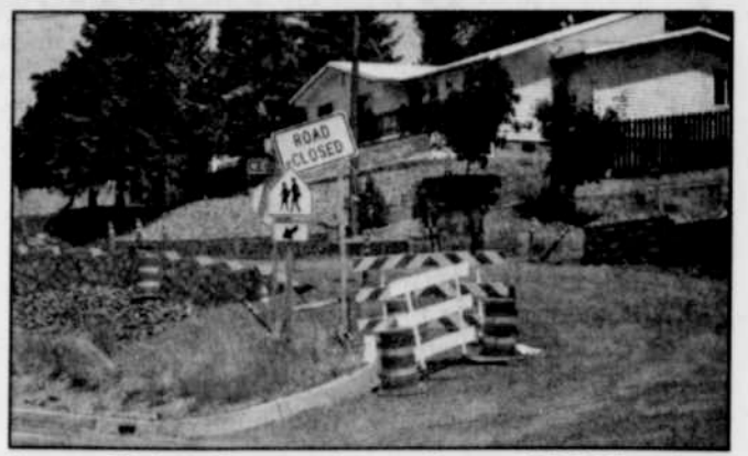
Barratt Blvd. in Heppner is one of several ODOT projects that have taken place in Morrow County over the past year.