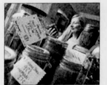
As interest is growing in food preservation, the Oregon State University Extension Service is offering its food safety hotline for the summer at 1-800-354-7319.

about the Master Food Preserver Program, go to http://bit.ly/OSU_FoodPreservation and http://extension.oregonstate.edu/fch/food-safety . OSU Extension's Ask an Expert service also takes online questions about food preservation at http://bit.ly/OSU_AskAnExpert . Additionally, Master Food Preservers run a holiday food safety hotline every November.