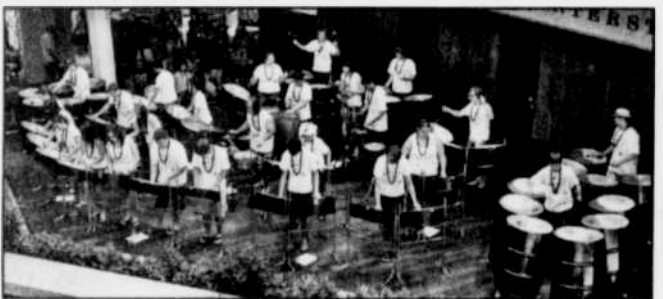
Bram Brata steel drum band.

Music in the Parks on July 15 is at the Boardman Marina Park at 7 p.m., this time featuring Bram Brata.