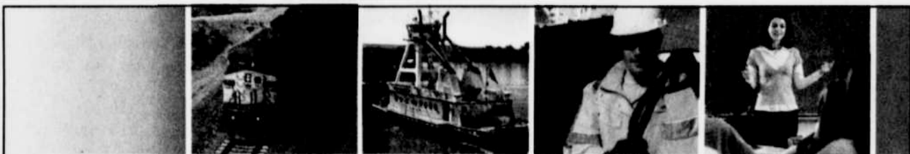
A pathway to jobs. An investment in rural counties.

We Print Business Cards Lots of Papers Full Color available Heppner Gazette-Times 541-676-9228