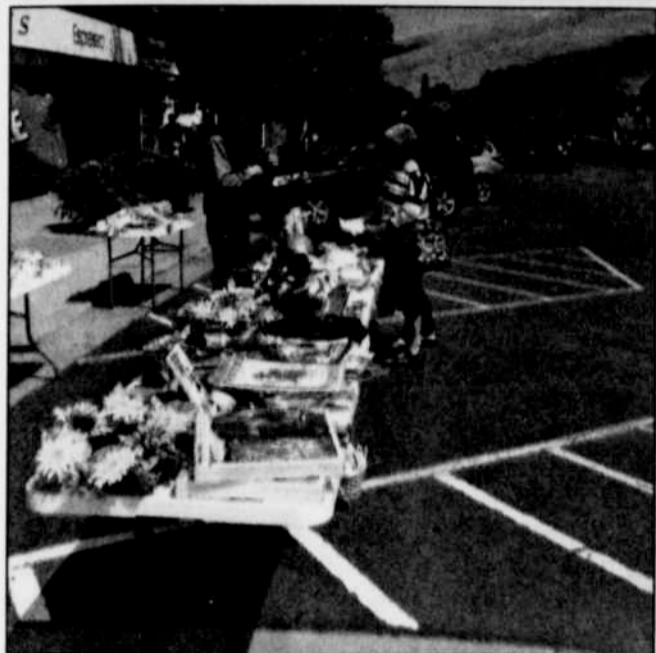
Clockwise from left: Diners start the celebration early at the Community Bank barbecue on June 4; Shoppers browse the selection at the Quilter's Round-Up sidewalk sale; The Bank of EO serves up hot dogs and hamburgers to Celebrate Heppner attendees; Shoppers stop for conversation in front of Murray's Drug.

Deadline for news and advertising - Mondays at 5:00 pm