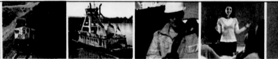
A pathway to jobs. An investment in rural counties.

-Heppner Ambulance reports transporting a patient from Pioneer Memorial Hospital to Hermiston.