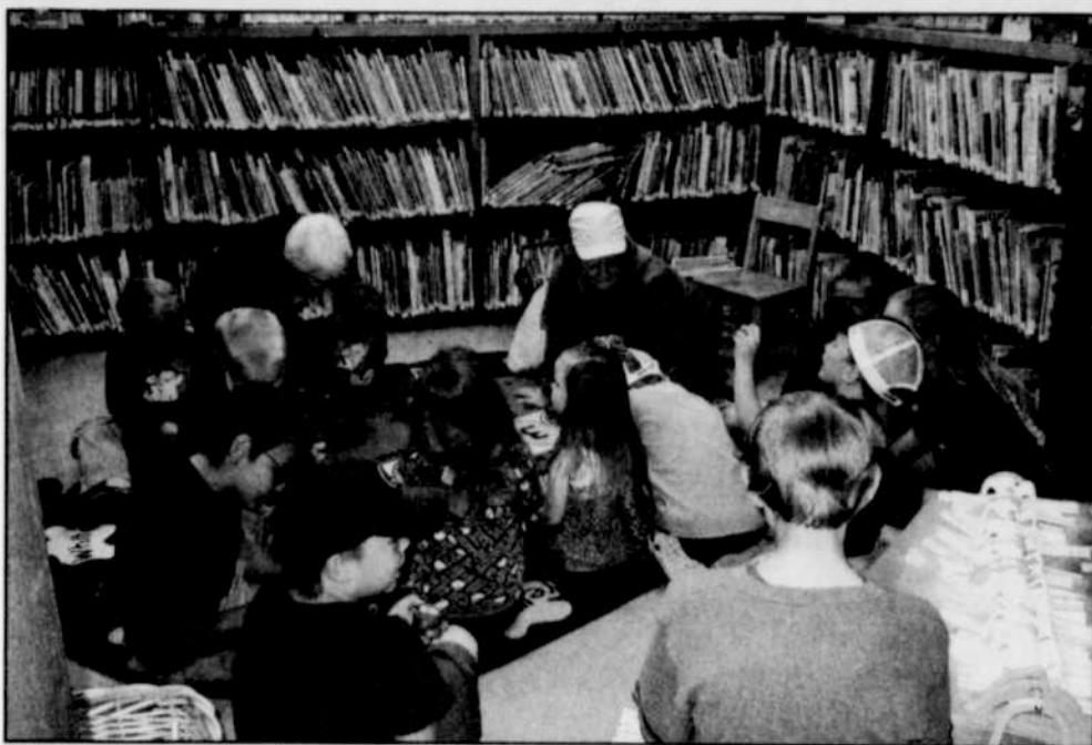
The Heppner branch of the Oregon Trail Library District saw a good turnout for the opening day of its Summer Reading program, "Dig into Reading." Children listened as a librarian read rock-themed books and then made pet rocks as a craft project (pictured). Summer reading sessions will take place every Friday at 10:30 a.m.