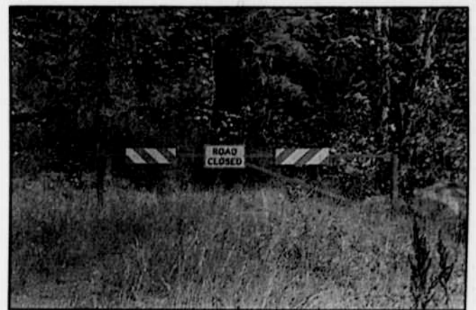
Road closures on the Umatilla National Forest have sparked controversy as hunters express concern over the loss of forest access.

Buchholz explained that the Forest Service districts conduct environmental analysis each year, taking into account areas that