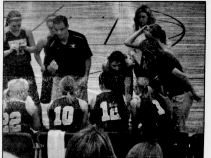
The Mustang girls' basketball team huddles to formulate strategy during the first-round battle against Vernonia last week. The Mustangs had a plan, and it showed, with a 62-33 victory catapulting them into the state quarterfinals in Pendleton.

The Heppner Mustangs jumped out to a 15-9 lead. Things cooled off for the Mustangs as the Loggers fought back into the contest to pull ahead 23-21 with two minutes to go in the second quarter. Bas-